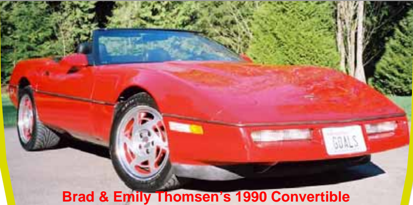
Brad & Emily Thomsen's 1990 Convertible