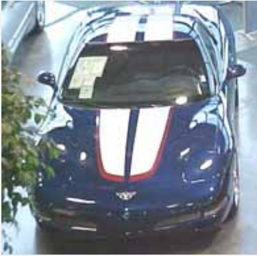
2004 Blue ZO6 Commemorative Edition