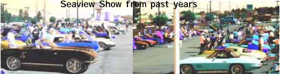
Seaview Show from past years

Corvettes must be registered & in place by 11 am for S & S Ballot box closes at 2 pm Trophies awarded at 2:30 pm Contacts: Han Song (Seaview) (425) 742-1920 Rick Milsow (CMCS) (425) 486-2309 rick.mi@verizon.net