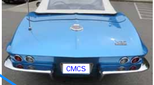
1966 blue Sting Ray and 2014 blue Stingray Almost 50 years between!