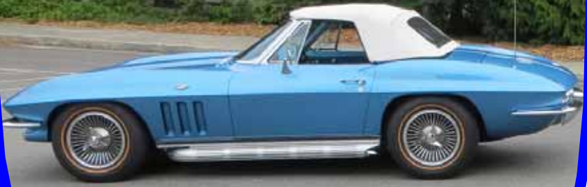
Scott Robb's 1966 Nassau Blue Convertible