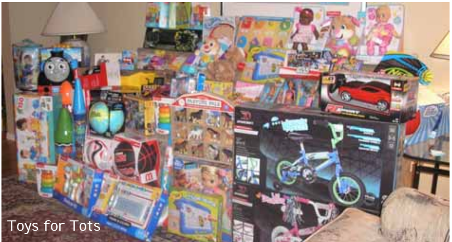
Toys for Tots