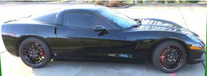
Gary & Karrie Osborne's 2006 Black Coupe