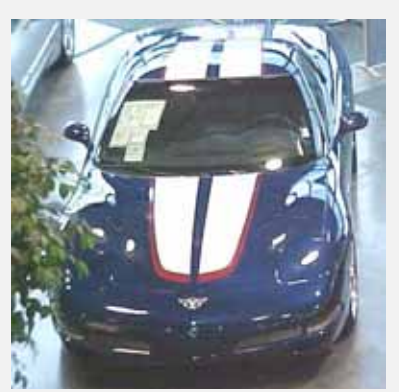
2004 Blue ZO6 Commemorative Edition