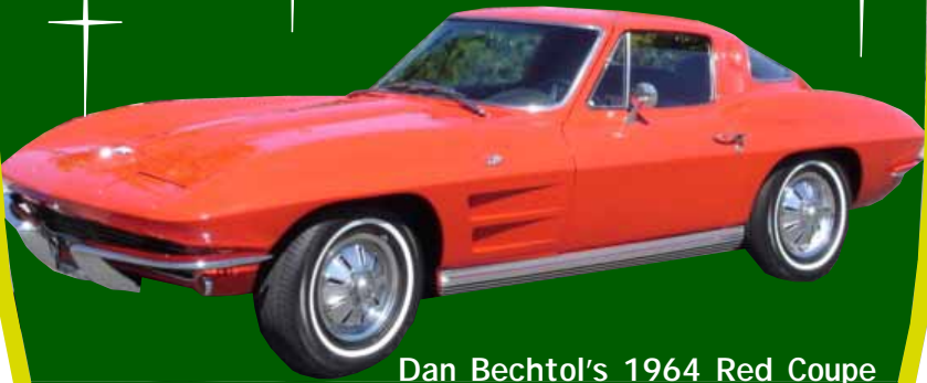
Dan Bechtol's 1964 Red Coupe