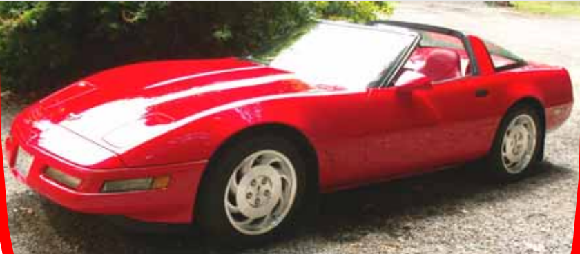
Craig & Lorraine Crummer's 1996 Torch Red Coupe