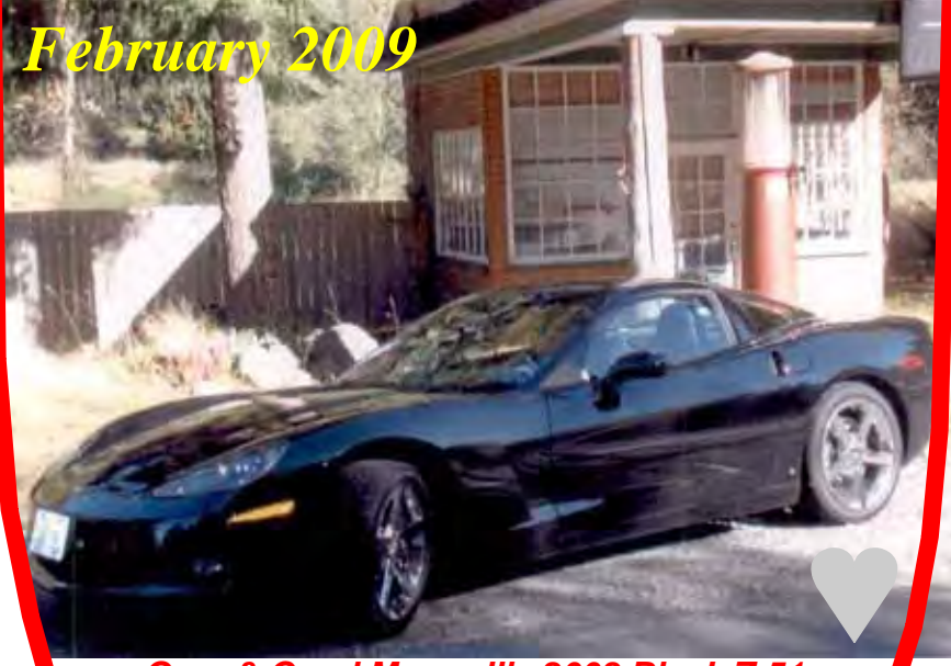
Gary & Carol Maxwell's 2008 Black Z-51