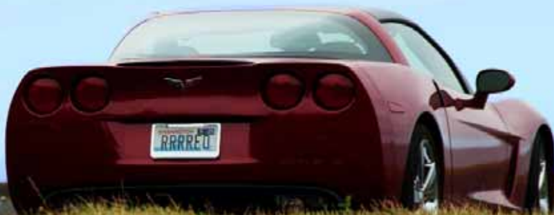
Alton and Aldene Loe's 2009 Coupe