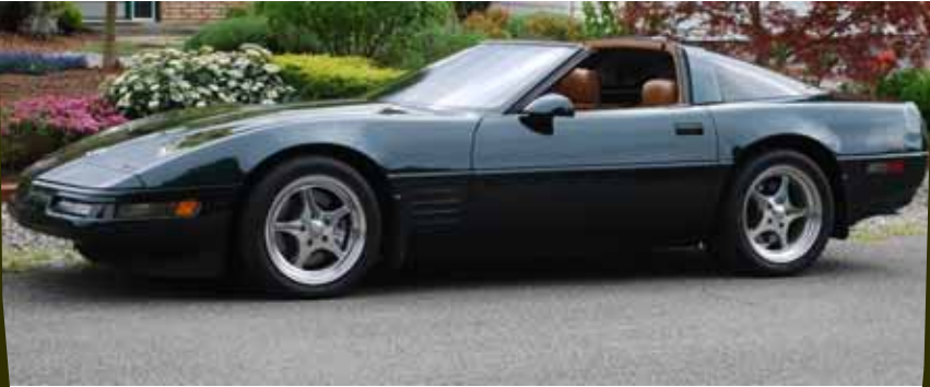
Chuck Buechner & Cyndy Becklund-Buechner's 1991 Polo Green ZR1