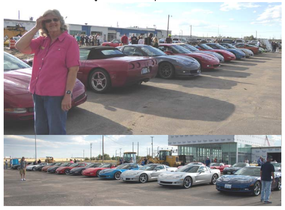
Day 4, Monday August 25

Northern Utah Caravan joined us in Cheyenne.