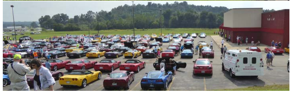
However, many were not clear about the whereabouts in