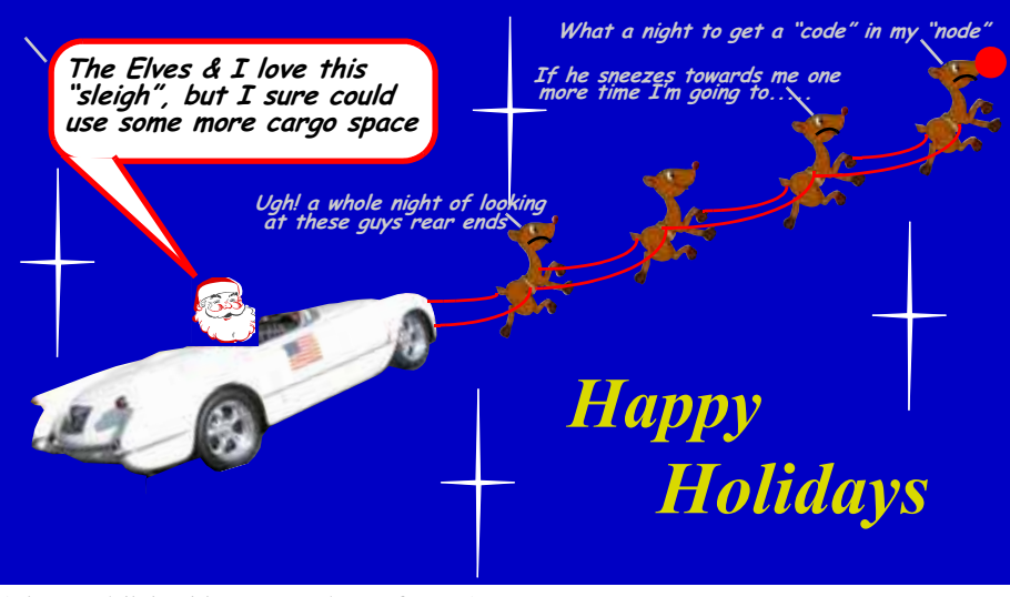
(First published in December of 2004)