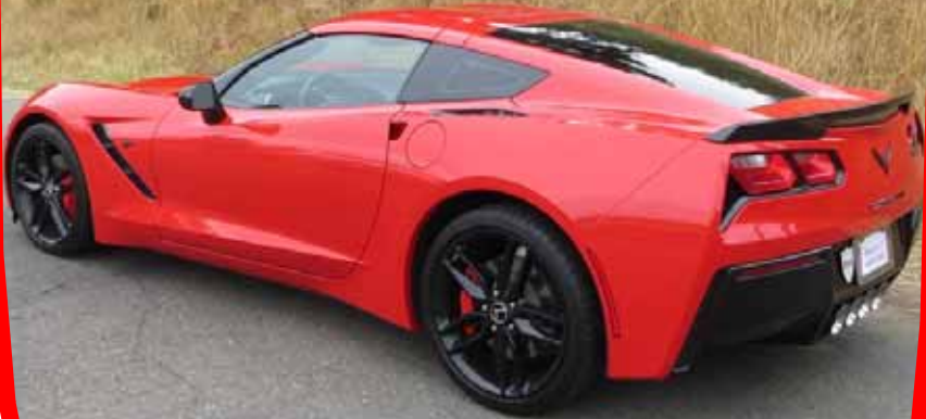
Leo & Laurie Carpenter's 2015 Coupe