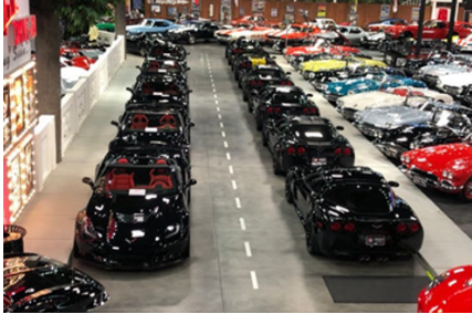
VIN 0001 Black Corvette Rolls off the Assembly line Rick Hendricks current collection of VIN 001 Vettes

Currently Hendrick's Chevrolet dealerships have about 1000 pre-orders for 2020 Corvettes and he's stopped taking orders for more at this point as he figures it will be a few years before the 1000 are filled. Initial vehicle shipments of the new 2020 Corvette Stingray to dealers are expected to begin in late February or early March.