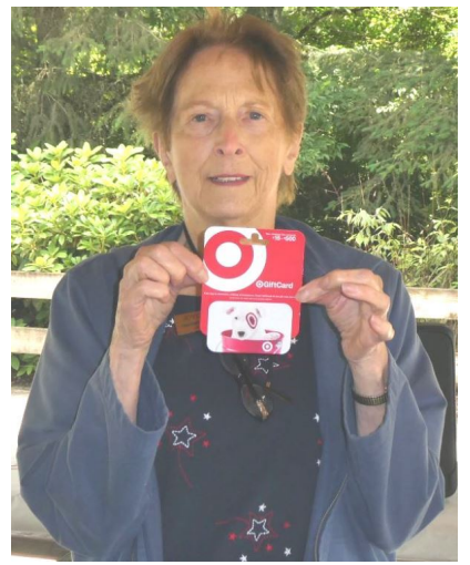
2nd-Jan Harris 4th of July USA Chocolate Cake