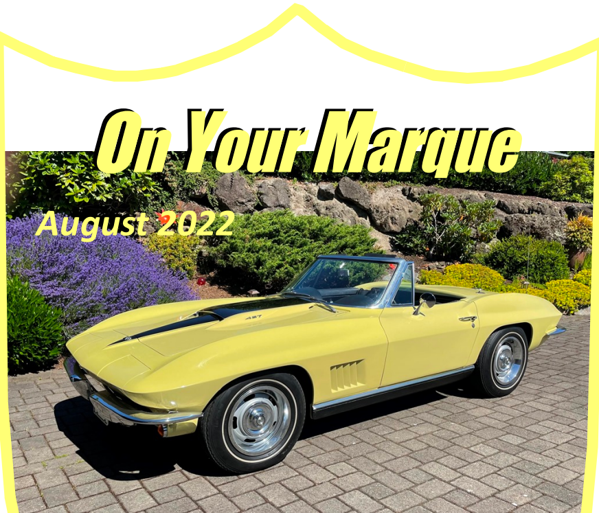
Susan Allen's 1967 Sunfire Yellow Convertible