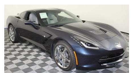
2015 Night Race Blue Auto GS 3LT Coupe