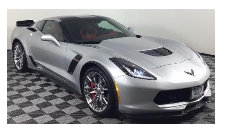
2015 Blade Silver Z06 Auto Coupe