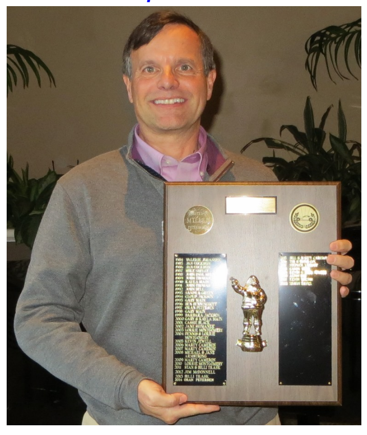
2022 3rd Quarter Recognition Award