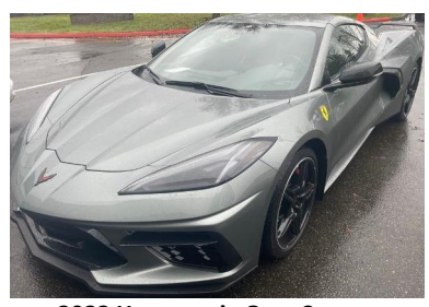
2023 Hypersonic Gray Coupe