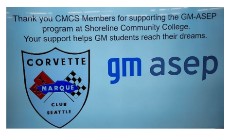
Welcome & Thank You was on all the Monitors in the Shop Area