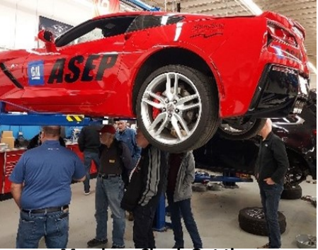
Members Check Out the Underside of a C7 in the Shop