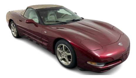
2003 50th Anniversary Red Auto Convertible